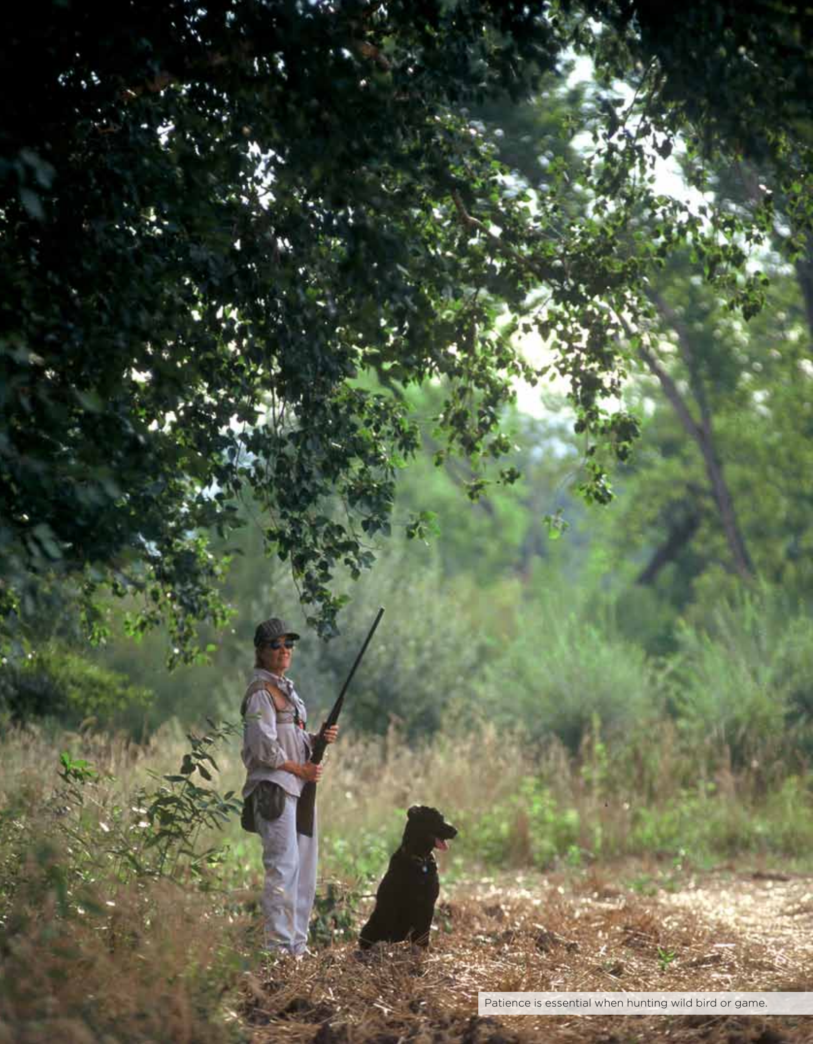
Patience is essential when hunting wild bird or game.